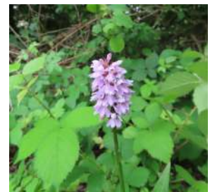
Common Spotted Orchid