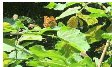
Silver Washed Fritillary Moth