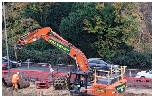
Auger Boring underneath Bearsted Road into Vinters Park Crematorium

We have recently installed a deep drainage crossing to Bearsted Road, by means of Auger Boring. This method of pipe installation has enabled works to progress without causing any disruption to traffic. Traditional pipe installation and trenching would have involved closures to Bearsted Road.