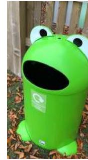
New Bins in the Old School Playing Field