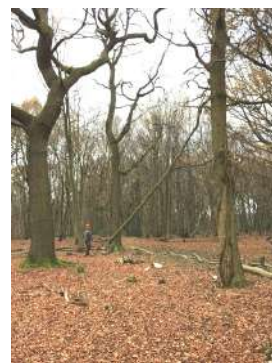
Coppicing in Horish Wood

**The theft of Hornbeam seating from the Forest School site has been reported to the Police.