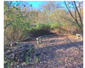
Forest School Horish Wood Clearance