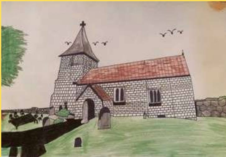
Antonio Aged 10