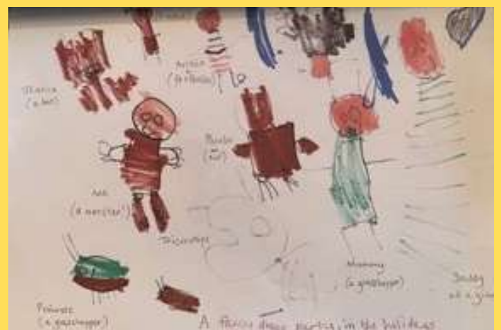
Blake Aged 4