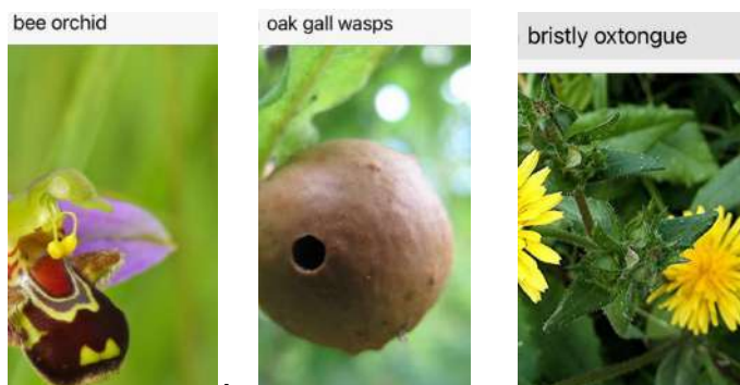
The Old School Playing Field

ASH DIE BACK is present causing substantial canopy loss - which will need addressing this winter -and removal of some trees by MVCP and their volunteers.