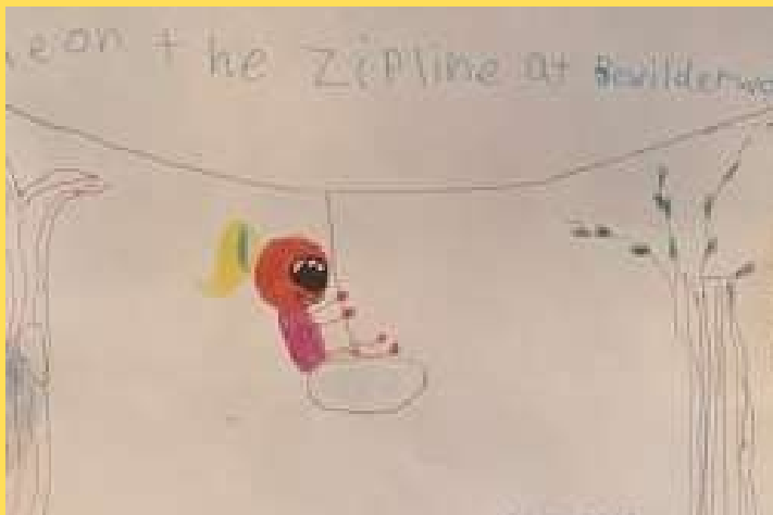
Phoebe Aged 7